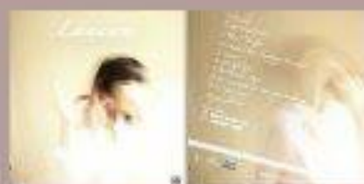
■ CD cover - white 2 - Pandora, 2009